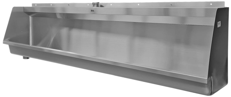
Front View - UR3